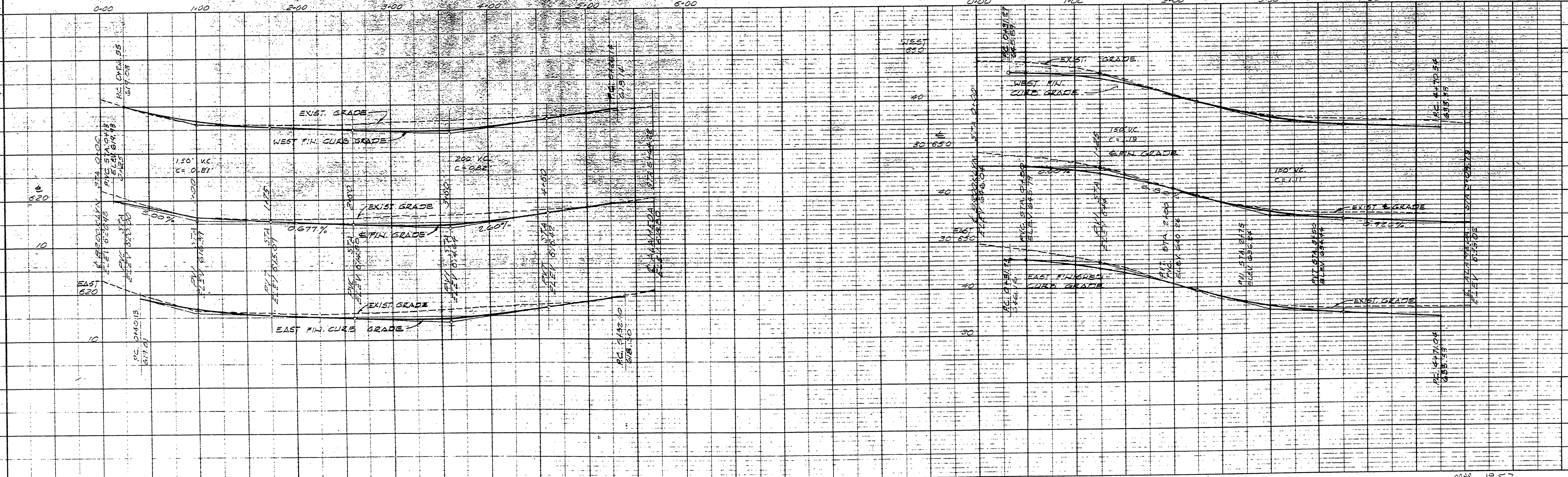
PLATE 1 - PLAN - PROFILE B. R. B. STANDARD 100% REPRODUCED FROM ORIGINAL DRAWING ENGINEER DESIGNER