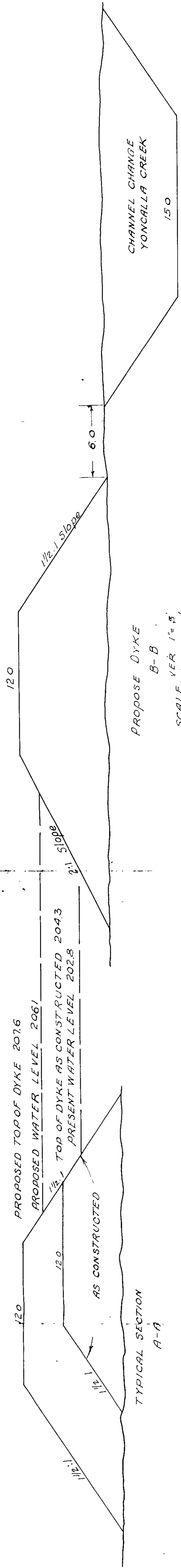
PROPOSED DYKE B-B VER 1" = 5' HOR 1" = 5'

NOTE: Construction to be governed by specifications of the State Engineer